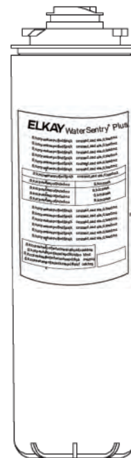
Replacement Model 51300C shown

This filter has been tested to the following NSF International standards: ANSI/NSF Standard 42 Chlorine-Class 1, Particulate-Class 1, and Taste and Odor. ANSI/NSF Standard 53 for Reduction of Lead.