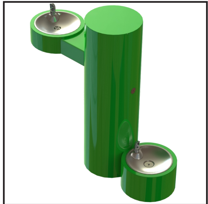
Model GRJ85-PF Shown

2 This option is not available freeze-resistant.