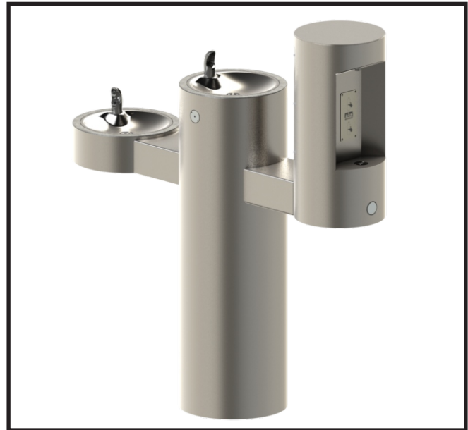
Model GYV34 Shown

Barrier-free drinking fountains with bottle filler shall be Murdock model GYV34. Construction shall be 12 gage, all stainless steel with 18 gage stainless steel fountain bowls. Pedestal base shall have four mounting holes. Access covers shall be secured with vandal-resistant stainless steel screws. Bottle filler shall be activated by a 9-volt sensor or a pushbutton as standard. Unit shall contain a 100-mesh inlet strainer, lead and cyst filter, 6-AA battery pack and laminar flow spout. Self-closing pushbutton, needing less than 5 pounds of force, shall activate internally mounted valves with adjustable stream regulators. Bubblers shall be stainless steel with non-squirt feature and operate on water pressure range of 20-105 PSIG. Fountain is certified to ANSI A117.1, Public Law 111-380 (NO-LEAD), CHSC 116875 and NSF/ANSI 61, Section 9. Fixture meets ADA requirements when mounted appropriately.