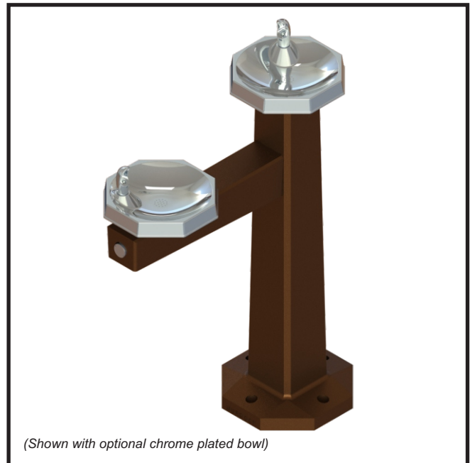
(Shown with optional chrome plated bowl)

All solid brass castings shall conform to ASTM standards B61 and B62. Unit is certified to ANSI A117.1, Public Law 111-380 (NO-LEAD), CHSC 116875 and NSF/ANSI 61, Section 9.