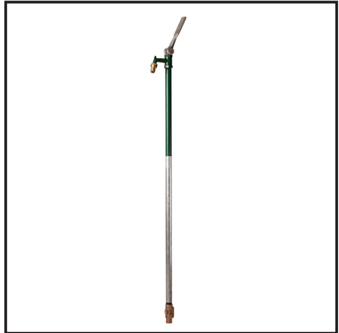
Model M-92-VB Shown

Outer casing shall be black iron pipe, finished with a heavy grade of oil-based green enamel. Nozzle shall be solid brass casting, threaded for 3/4" hose connection.