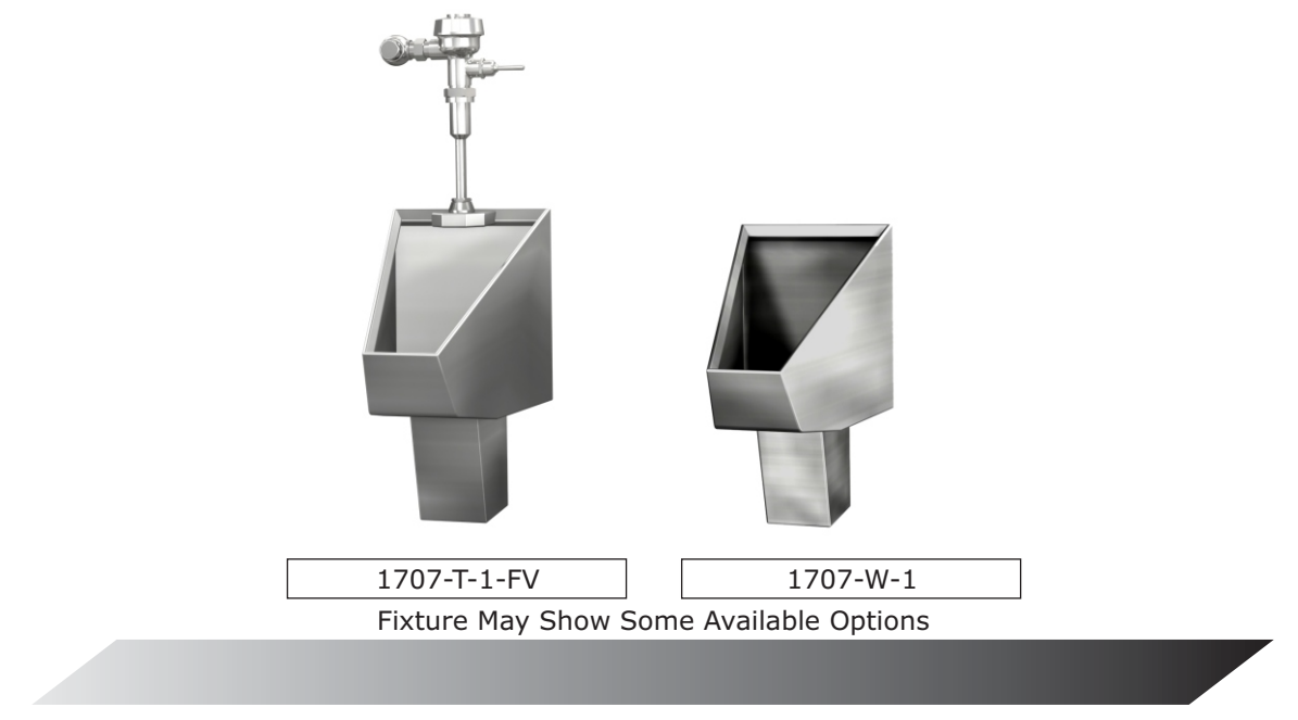
Please visit www.acorneng.com for most current specifications.

Straddle - Washout Urinal - ADA Compliant