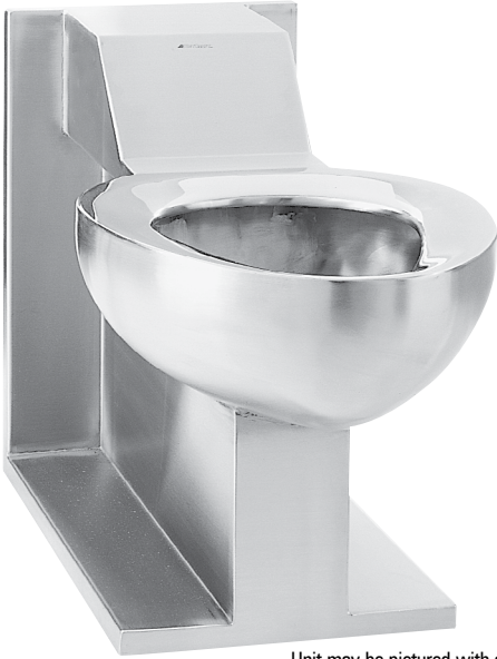
Unit may be pictured with some optional features.