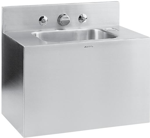
Unit may be pictured with some optional features.