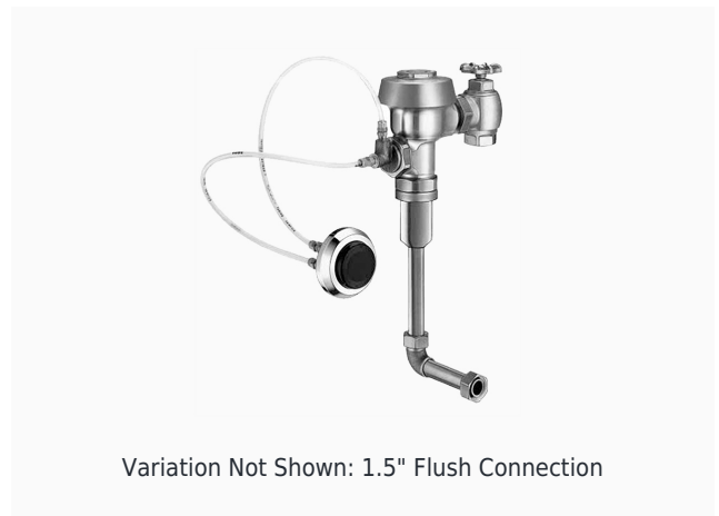
Variation Not Shown: 1.5" Flush Connection