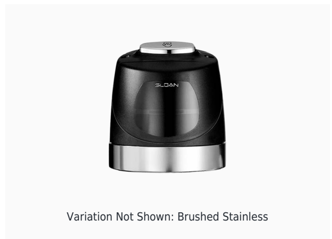
Variation Not Shown: Brushed Stainless